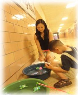
Frog Jump Game