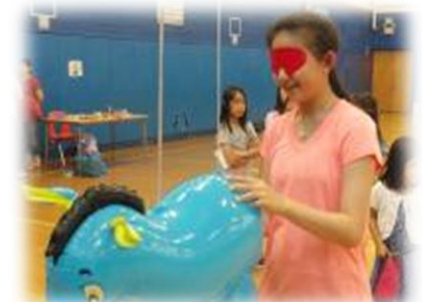
Donkey & Tail