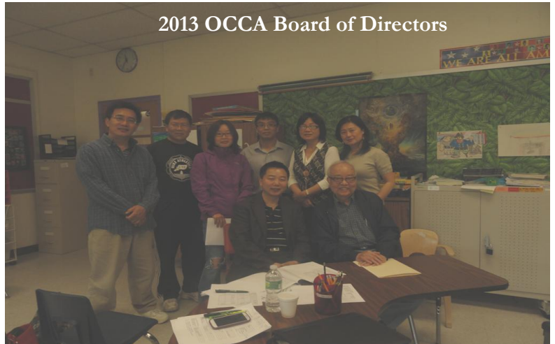
2013 OCCA Board of Directors