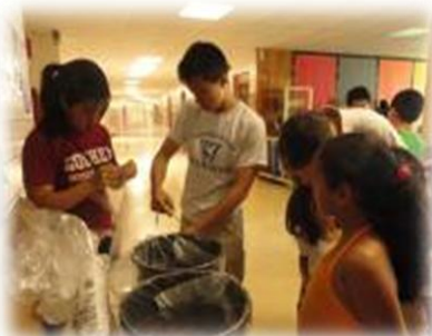
Taking home live goldfish