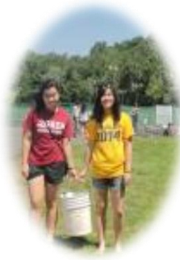
Volunteering is fun!