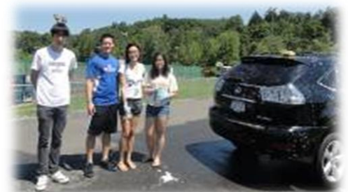
High School Seniors in Service